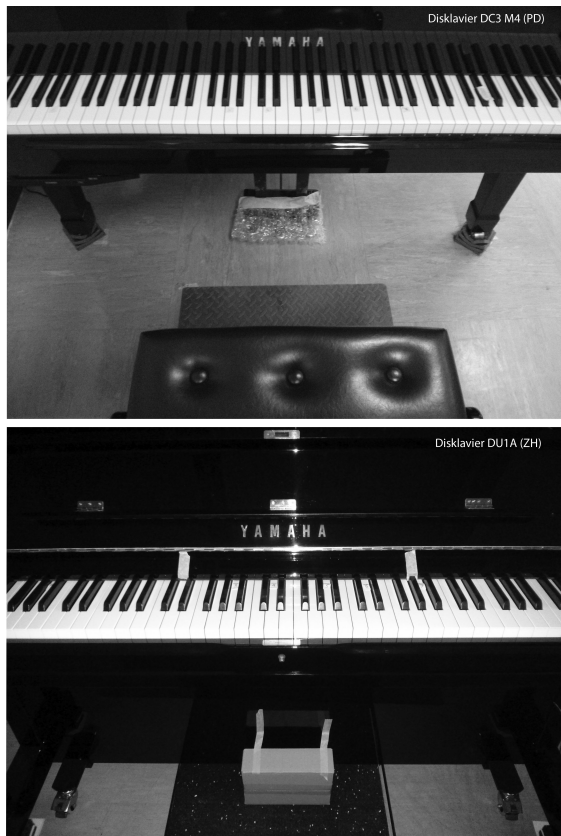
Figure 2: Disklavier setups. Top: Yamaha DC3 M4 (PD). Bottom Yamaha DU1A (ZH).

control with the help of a software developed in the Pure Data environment. The program allowed to read playlists describing the series of randomized trials (e.g. A4, vibration OFF), and record answers for each subject. The quiet mode of the Disklavier pianos was remotely switched at need via automatic software control. At each trial, a correctness test was performed to check on the played note and velocity (see Section 3 for more details).