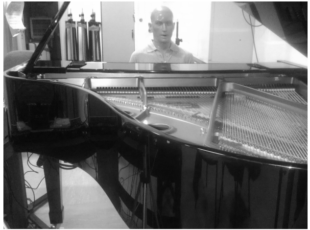
Figure 1: Setup for loudness estimation on the grand piano (PD) using a KEMAR mannequin.

The experiment made use of two Yamaha Disklavier pianos, a grand model DC3 M4 (setup in Padova, “PD” hereafter) and a upright model DU1A with control unit DKC-850 (setup in Zurich, “ZH” hereafter), offering a switchable “quiet mode” that allows their use as silent MIDI keyboards. In this configuration the hammers are prevented from hitting the strings, and therefore the piano does not resound nor vibrate, while the keyboard mechanics is left