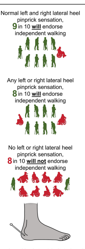
Fig 3 The S1 lateral heel pinprick clinical prediction rule.

walkers when applied within 0-7 days of SCI, yet may work best for ruling out future independent walkers when applied later on.