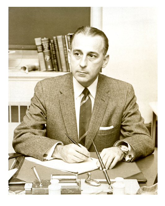
FIGURE 1 Charles A. Hufnagel (1916–1989)