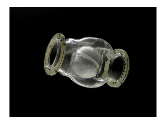
FIGURE 2 Original Hufnagel's ball valve prosthesis (reproduced with permission by Division of Medicine and Science, National Museum of American History, Smithsonian Institution, Washington, DC).

In 1975, Fishbein and Roberts described the clinical and pathological observations in 2 patients who died between 11 and 13 years following implantation of a Hufnagel prosthesis.<sup>10</sup> Despite the extended survival they did not find any signs of thrombosis, ball variance or hemolysis at necropsy. Based on these findings, they suggested that replacing the Hufnagel prosthesis at future operations on the aortic valve would have been unwise.<sup>10</sup>