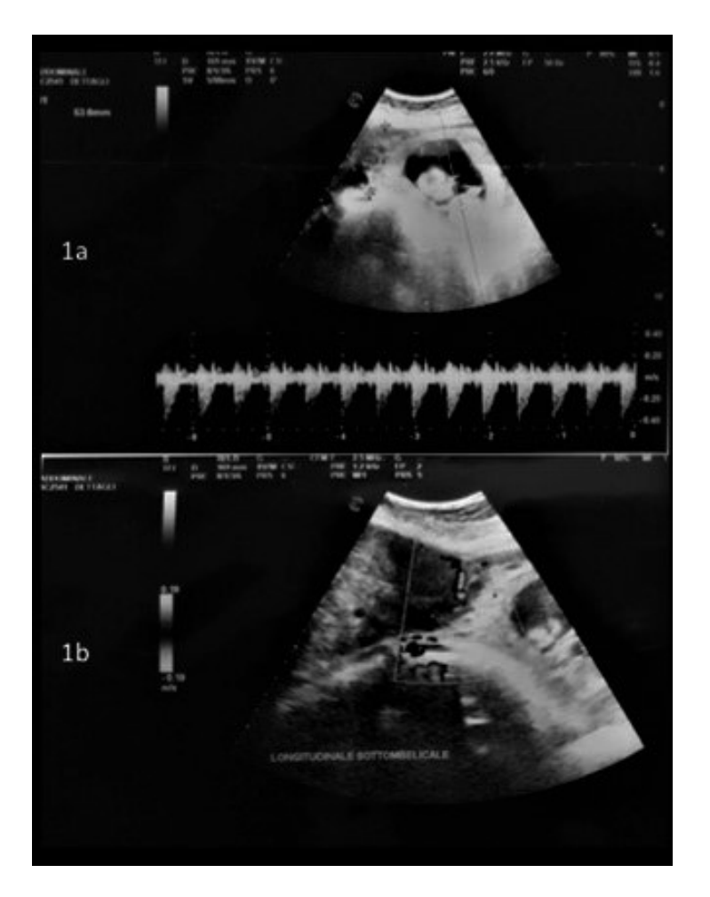
Figure 1. (a) Doppler ultrasound to check fetal heartbeat; (b) Assessment of the position of larger myoma and its pedicle.