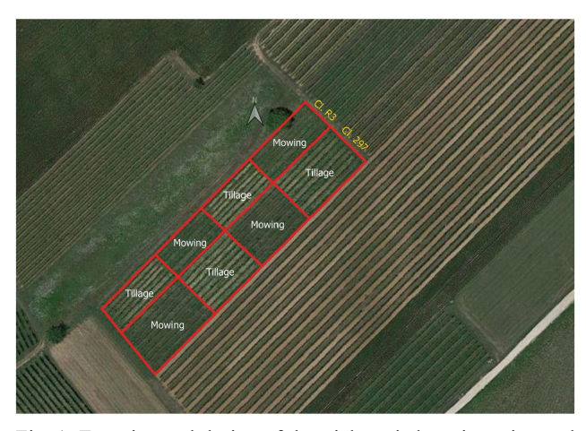
Fig. 1: Experimental design of the trial carried out in a vineyard of north-eastern Italy (Cormons, Gorizia), planted with two clones of 'Sauvignon Blanc', where two different inter-row management strategies ( i.e. tillage-TT and mowing-MT) were compared (aerial image modified with QGIS; QGIS.org, 2021; QGIS Geographic Information System; QGIS Association; <u>http://www.qgis.org</u>).

Vineyard site: The study was carried out during two consecutive years (i.e. 2013 and 2014) in an organic vineyard located in north-eastern Italy (locality Cormons, Gorizia district, 45°56'56"N, 13°27'11"E, 46 m a.s.l.). The vineyard was planted in 1980 with two clones of 'Sauvignon Blanc' (Vitis vinifera L.), i.e. clones R3 and 297 grafted on SO4. The vineyard consisted of 16 rows 140 m long and N48°E oriented. The first nine rows (south side) were planted with clone 297 and the following seven with clone R3 (Fig. 1). The vine spacing was 1.7 m between vines and 2.7 m between rows and trained to the Guyot training system. The soil was of alluvial origin, with moderately high gravel content (20-30 % in the first 50 cm of soil) and loam texture. In the years prior to the study, every second inter-row was tilled. Fertilisation and irrigation were set up according to the farm schedule. As for the canopy management, standard agronomical practices have been carried out during the trial