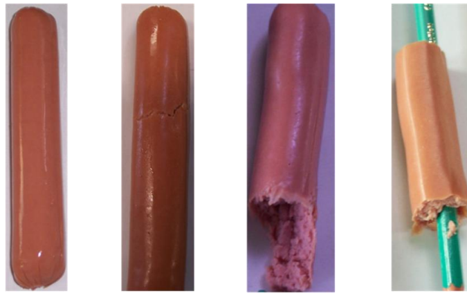
Figure 2 – Classification of the damage on fingers from left to right - scale of damage (1.2.3.4)