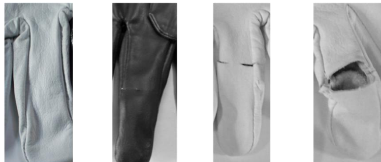
Figure 1 – Classification of the damage on fingers from left to right - scale of damage (1.2.3.4)