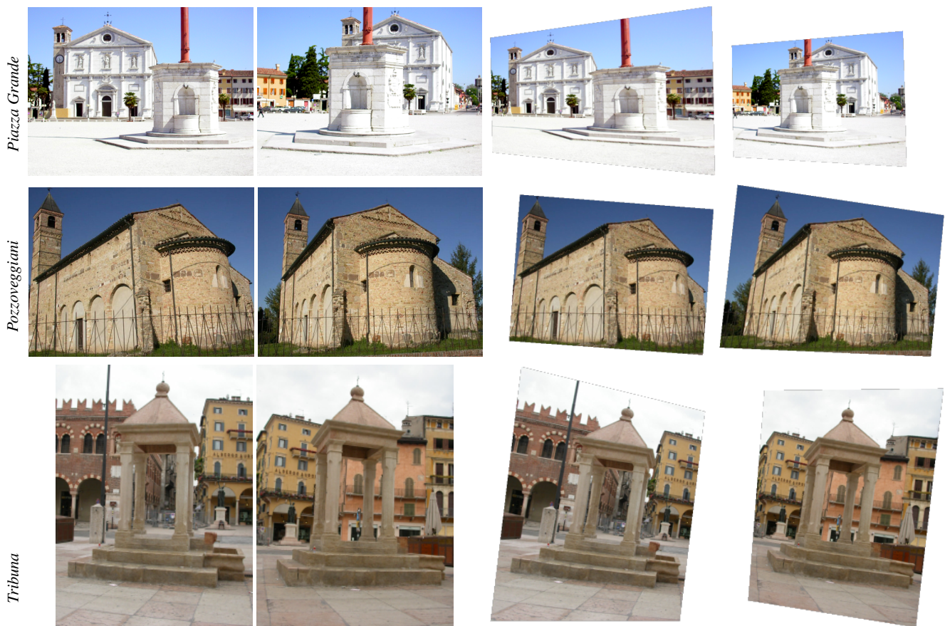
Fig. 5 Original uncalibrated pairs (left) and Quasi-Euclidean rectification (right) obtained without manual intervention.