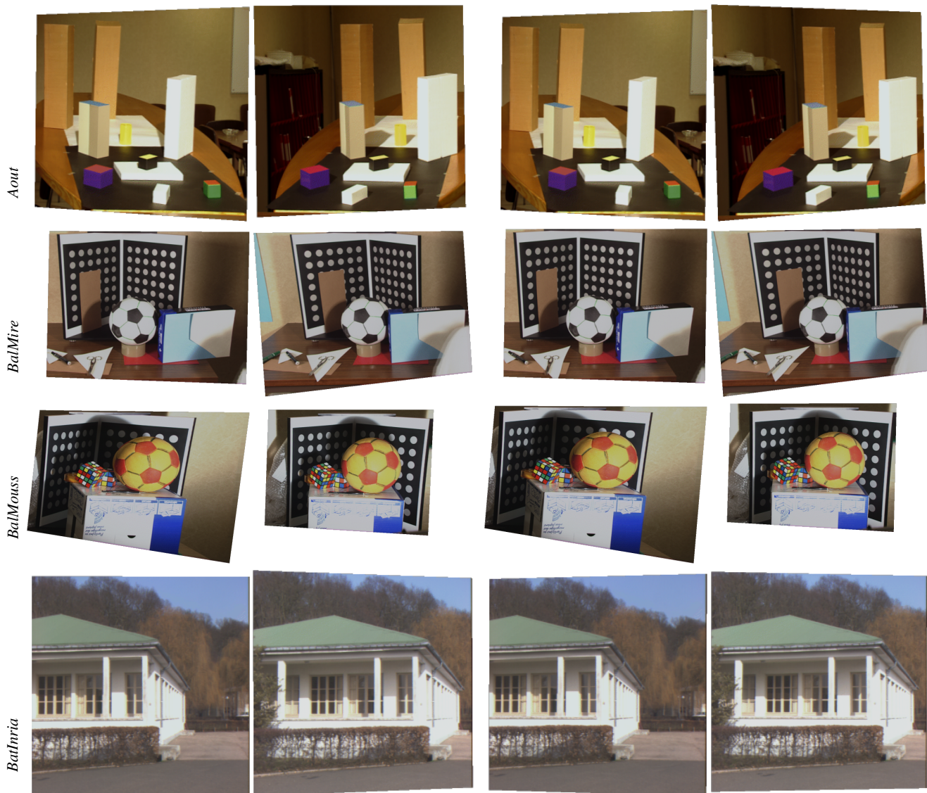
Fig. 1 Euclidean (left) and quasi-Euclidean rectification (right) of the SYNTIM pairs.

where N is the number of corresponding pairs. The figures, beside confirming that the pairs are indeed rectified, reveal that the error achieved by the quasi-Euclidean rectification are consistently smaller than in the Euclidean rectification. This makes sense, because the former explicitly minimizes a rectification error (although not exactly e_{\text{rec}} ), whereas the latter derives the rectifying collineations directly from camera matrices in closed form. Therefore small calibration errors propagates to the rectification results without feedback.