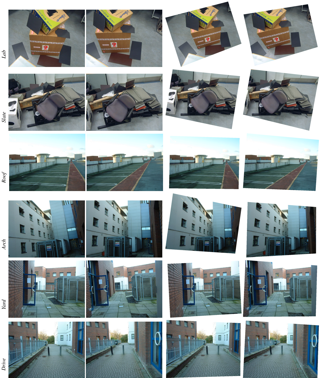
Fig. 4 VSG images [16]. Original pair (left) and quasi-Euclidean rectification (right).