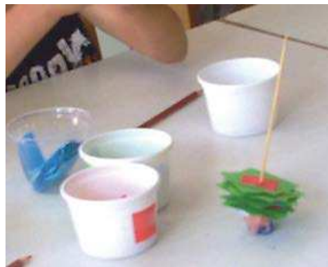
Figure 2. The wooden skewer adopted for the first strategy

In the first class, we provide to each pupil a wooden skewer (a long toothpick) with some plasticine at one end of it, several preprinted smiles and squares of different size (Figure 2). Fixing one end of the skewer on the table using the plasticine, it remain in a vertical position; then the researcher read a question and, depending by the type of the question, ask to pupils to put the smile (or the square) that better represents their opinion as concern the question. Each pupil has its own skewer and to answer to the questions they had to select one smile or one square and put in on the skewer. At the end of the questionnaire, looking at the papers that the pupils put on the skewers, we can collect data on each answer gave by each pupil.