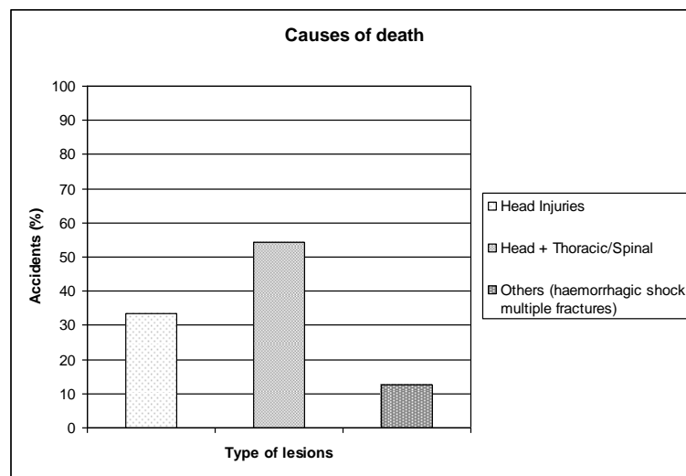
Figure 3 – Anatomical distribution of causes of death

In deaths caused by falls from height, there is often a characteristic disproportion between external lesions (bruising, abrasions, lacerations and compound fractures) and internal lesions, which are widespread and more serious.