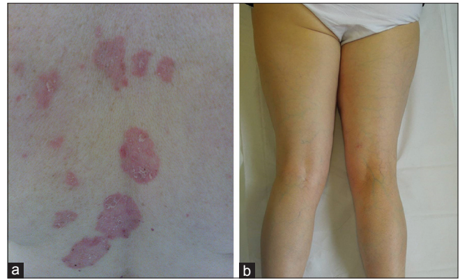
Figure 2: Several psoriatic plaques of the back (a) Complete regression of lichen striatus after 4 weeks of oral acitretin therapy (b)

Although LS is an asymptomatic and self-limited dermatosis, it may cause a significant psychological distress in some patients, thus requiring an appropriate therapy. Several treatments have been reported with various degrees of success including oral and topical corticosteroid, photodynamic therapy, topical calcineurin inhibitors, and oral acitretin. [4,5] Regarding this last therapy, there is only one report describing an extensive case