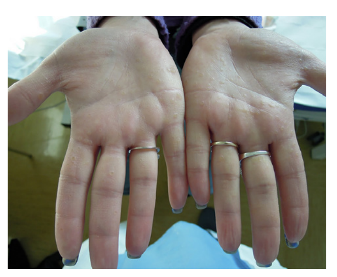
Figure 1. Multiple keratotic crateriform papules over the palms.