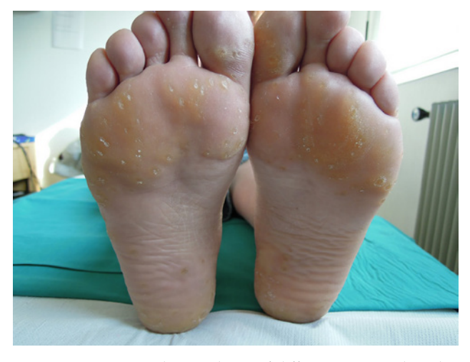
Figure 2. Numerous depressed pits of different sizes on the soles.