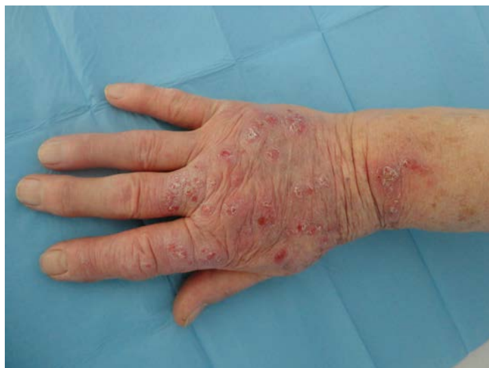
Figure 1. Clinical aspects. Erythema and edema with nodules, some of them ulcerated, and crusts all over the hand

An otherwise healthy 85-year-old woman presented with a 2-month history of deep erythema, subcutaneous nodules, and a painful and swollen right upper limb. Upon physical examination, the patient had erythema and edema with nodules, some of them ulcerated, and crusts all over her right hand and distal forearm (Figure 1). There was no lymphadenopathy and the patient denied fever, arthralgia, or any systemic symptoms. She recalled that she had wounded her second finger of the right hand while she was preparing fish and that the initial nodule had appeared near the initial trauma site after 2-3 weeks. The disease had progressed and other nodules appeared in a sporotrichoid pattern following lymphatic drainage. Before our visit, the patient had already been treated with empiric antibiotics such as amoxicillin for two weeks and ciprofloxacin for another two weeks without