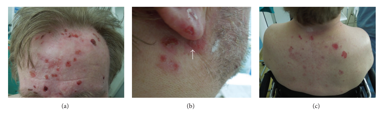
FIGURE 1: Several erosions (some of which with a peripheral epithelial collarette) and hematic and serous crusts on a slightly erythematous background on forehead (a), right periauricular region (b), and interscapular area (c); a flaccid blister (arrow) is visible under the right ear lobe (b).