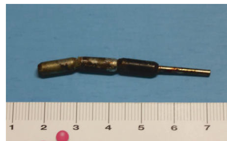
FIGURE 3: Magnets removed by the bowel.

occur, either by endoscopy or by laparotomy [16]. For ingestion of single magnetic FB, recommendations include close observation in asymptomatic patients, repeated abdominal radiographs within a few hours to assure advancement of the FB through the gastrointestinal tract, and immediate endoscopic or surgical removal in case of perforation or obstruction [15].