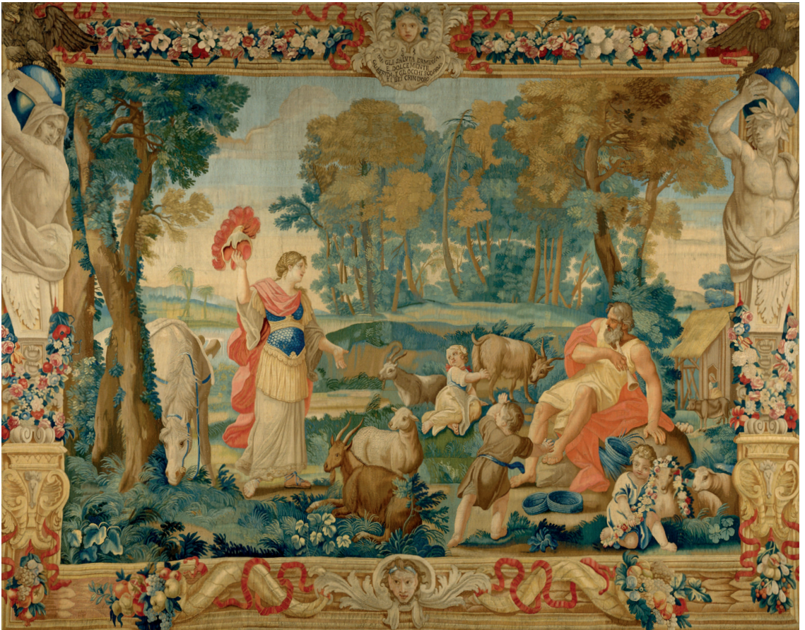
Fig. 5. Domenico Paradisi (Italian, active 1689–1721), designer. Erminia and the Shepherd , designed ca. 1689–93, woven 1732–39, tapestry (wool and silk), 363.2 × 457.2 cm. New York, Metropolitan Museum of Art, inv. no. 92.1.17.