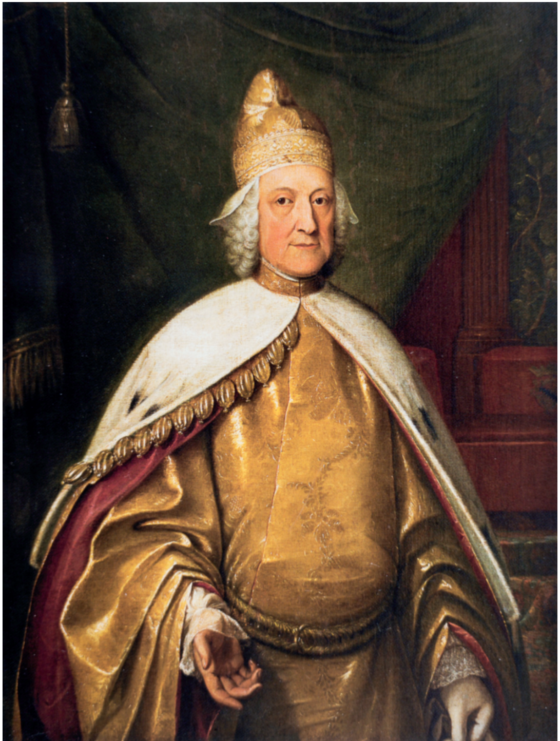
Fig. 4. Nazario Nazzari (Italian, 1724–after 1793). Portrait of the Doge Marco Foscarini , 1763, oil on canvas, 126 × 94 cm. Venezia, Museo Correr, Inv. Cl. I Nr. 230.