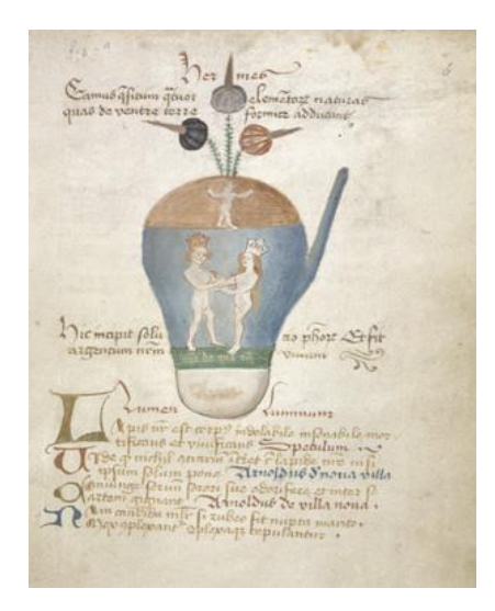
Figure 5 Donum dei (XV cent.) ©British Library Board (Sloane 2560, f. 6)

As already said, alchemists equate the genesis of the philosopher's stone with the birth of an infant, who is the fruit of the coniunctio between king and queen, Sol and Luna, sulphur and mercury (Abraham 1998, p. 148). A number of alchemical illustrations depict the philosophical child enclosed within the hermetically-sealed alembic that fulfils the function of a female uterus (Figure 5).