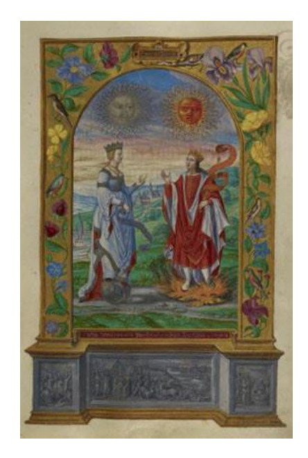
Figure 1 Splendor solis ©British Library Board (Harley 3469, f. 10r).

If the creation of the philosopher's stone is imagined as the birth of an infant, the reunion of all the contrasting polarities characterising the earthly dimension is, needless to say, regarded as a coniunctio or 'chemical wedding' between a man and a woman, often represented as a king and a queen (Figure 1).