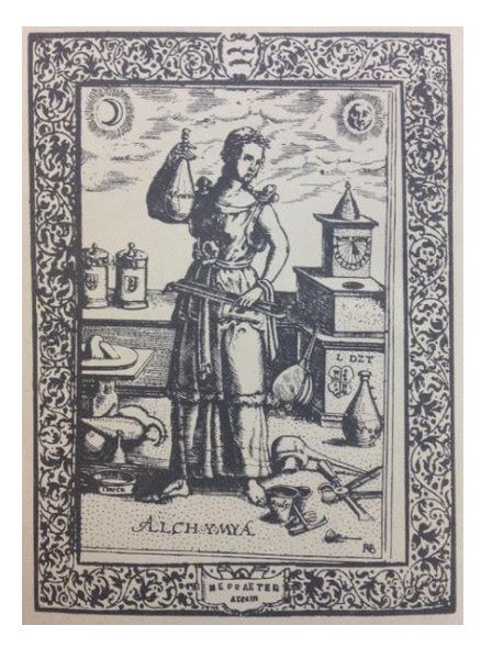
Figure 3 L. Thurneysser, Quinta Essentia (1570).