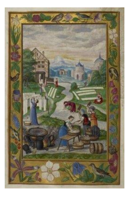
Figure 2 Splendor solis ©British Library Board (Harley 3469, f. 32v).

(1998). Legendary female figures like Cleopatra and Maria Prophetissa have always been connected with the alchemical tradition, but the relevance of women is especially manifest in "the gendered imagery of alchemy" (Ray 2015, p. 5). Since the opus entails several operations that recall the chores women daily perform in their households, alchemists compare "the work of cleansing and purifying the matter of the Stone" to "women's work" (Abraham 1998, p. 219). Scenes of women washing sheets appear in a number of alchemical plates and represent the phase of ablution, when matter is purified and cleansed of the blackness of nigredo and the stage of albedo is attained (Figure 2).