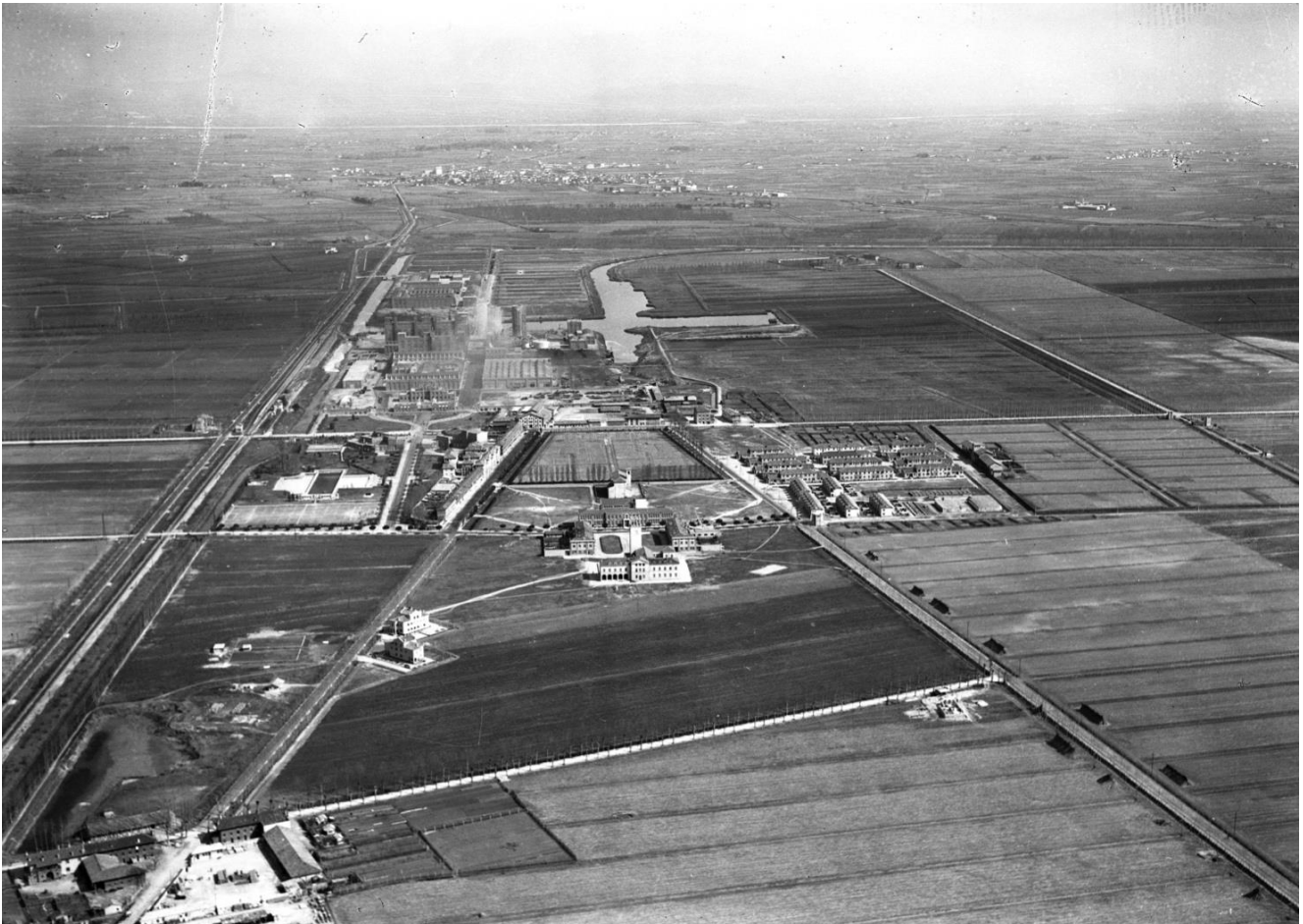
Fig. 1 – The company town of Torviscosa in 1948 - Source: Historical archive SNIA Viscosa, Torviscosa, FFSCN_TV-0187

The changed economic conditions, implying important changes in the local industry and community, led the progressive disposal, since the 70s, of the agricultural and rural housing estate of the company, partly sold to the tenants and mainly left abandoned (Bertagnin et al. , 1985).