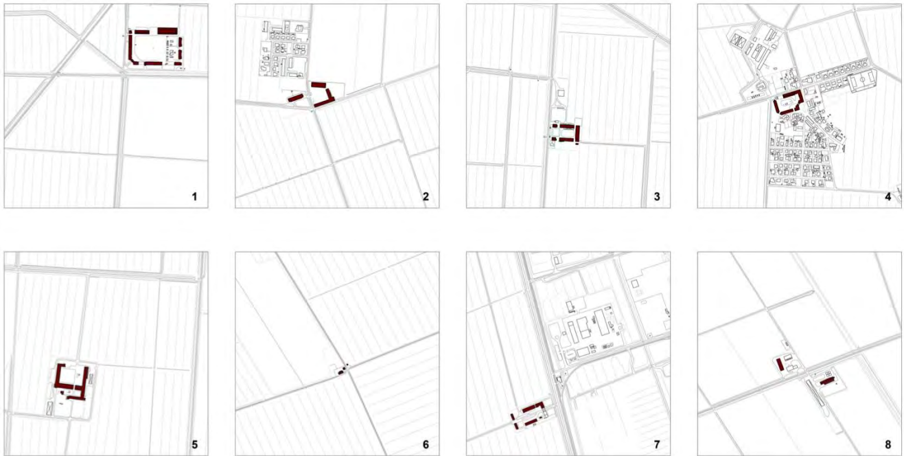
Fig. 3 – Agricultural centres of the eight Agency in 2019

In detail, the Agency 1 complex is located in the northern part of the territory of Torviscosa, in the Arsa area, and is characterized by the typical court layout of the Agencies' centres. The settlement, built between 1937 and 1945, includes: an entrance pavilion with portico and offices, stables for cattle breeding, warehouses and farm buildings, dwellings for the Agency's agricultural workers (breeders) and a votive chapel.