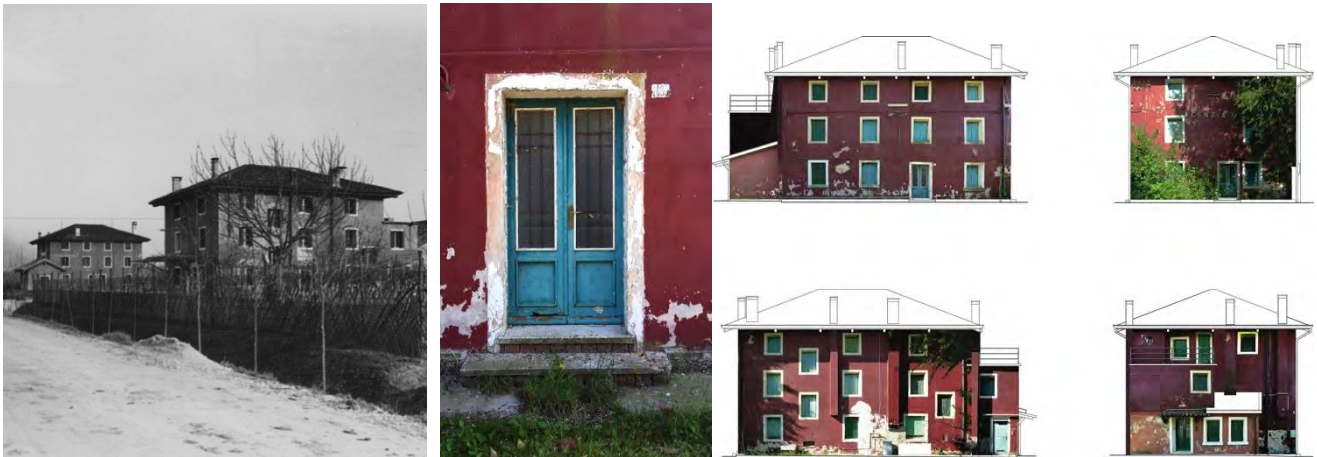
Fig. 5 – Houses in the Agency 3 in the 40s and today

Today, while the complex of Agency 3 is still partially used for farming, the two residential buildings are abandoned (Fig. 5).