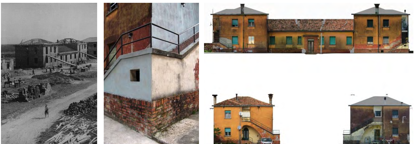
Fig. 4 – The rural houses in the Agency 1, Arsa area, Torviscosa, under construction in 1944 and today

The buildings are generally in need of maintenance and renovation and several apartments are disused.