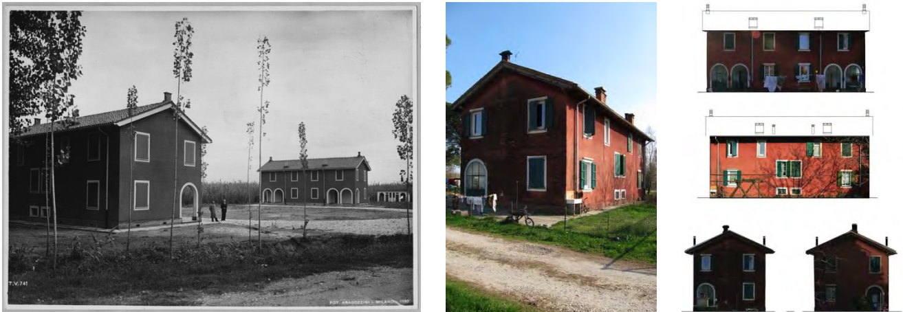
Fig. 8 – Houses for milkers in 1954 and today

Most of the houses for milkers in the countryside of Torviscosa are still inhabited, but many of them have experienced substantial modification in their interior organisation and external appearance.