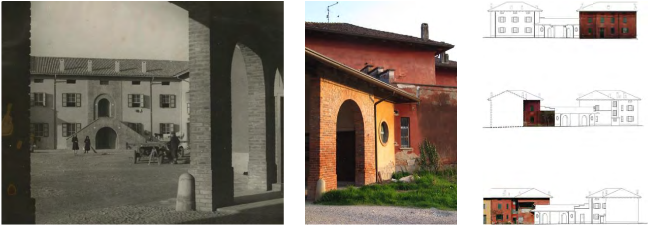
Fig. 6 – Agricultural Agency 4, Malisana area, Torviscosa, in the 50s and today