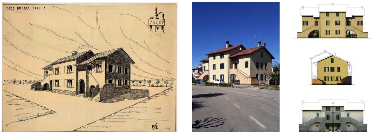
Fig. 7 – Rural houses in Malisana area, Torviscosa

The vertical structures are made of brick masonry, the floors are partly in hollow brick and r.c. and partly in timber beams and planks; the roof is in barrel tiles on timber structure; the facades are plastered in various colours with base in brick; original windows have a green wooden frame; the external stairs are in masonry and concrete, the flooring is mainly in cement tiles.