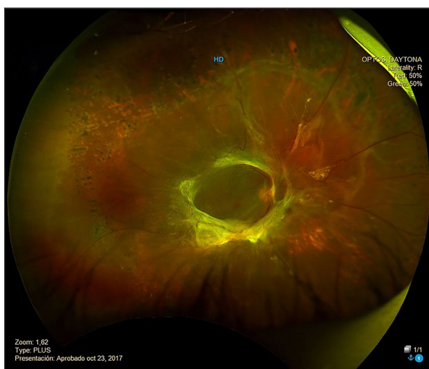
Fig. 1 Example of a UWF fundus image showing significant fibrosis due to proliferative diabetic retinopathy

Smartphone-based imaging tools may be useful for DR screening programs in which cost and availability of trained eye care personnel are barriers to implementation [24, 25]. However, no handheld device has been found to have comparable sensitivity and specificity to seven-field stereoscopic photography in detection of STDR. Rajalakshmi et al. [26] compared the “fundus on phone” (FOP) smartphone-based retinal camera with seven-field digital retinal photography and noted that the modalities yielded the same results for 92.7% of patients ( \kappa , 0.90). These authors suggested that the FOP camera was effective for screening and diagnosis of DR and STDR [26]. However, they noted that all patients underwent mydriasis in this study and that the image quality of the reference standard was superior to that of the FOP system. In this study, the smartphone was fixed and the patient’s head was secured by using a slit-lamp chin rest. This simple variation may significantly improve results