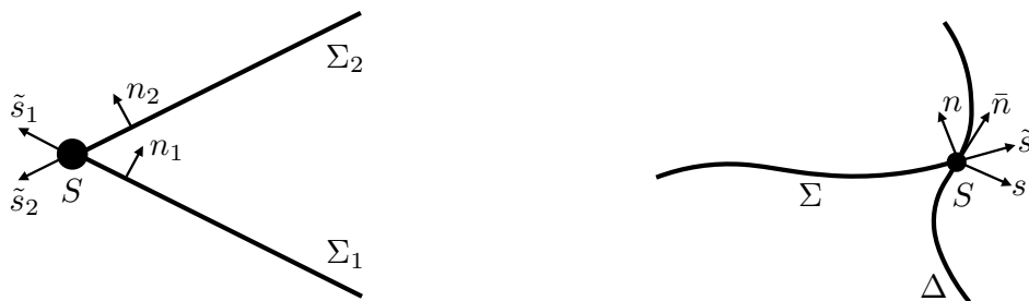
(a) Entangling wedge foliated by space-like Cauchy hypersurfaces \Sigma all joining at the corner 2-sphere S . (b) Time-like boundary \Delta intersecting a space-like Cauchy surface \Sigma at a 2-sphere S .