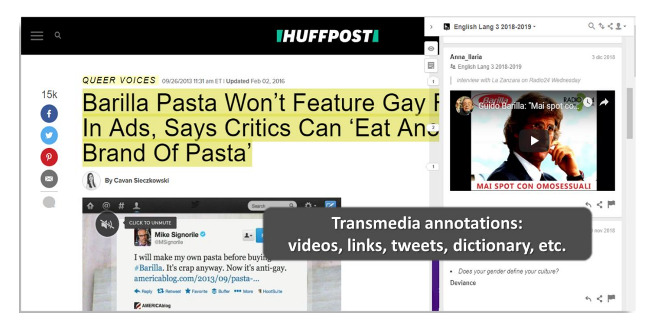
Figure 2 Transmedia annotations.

The learning dialogue of university language students in a digital environment for online text annotations