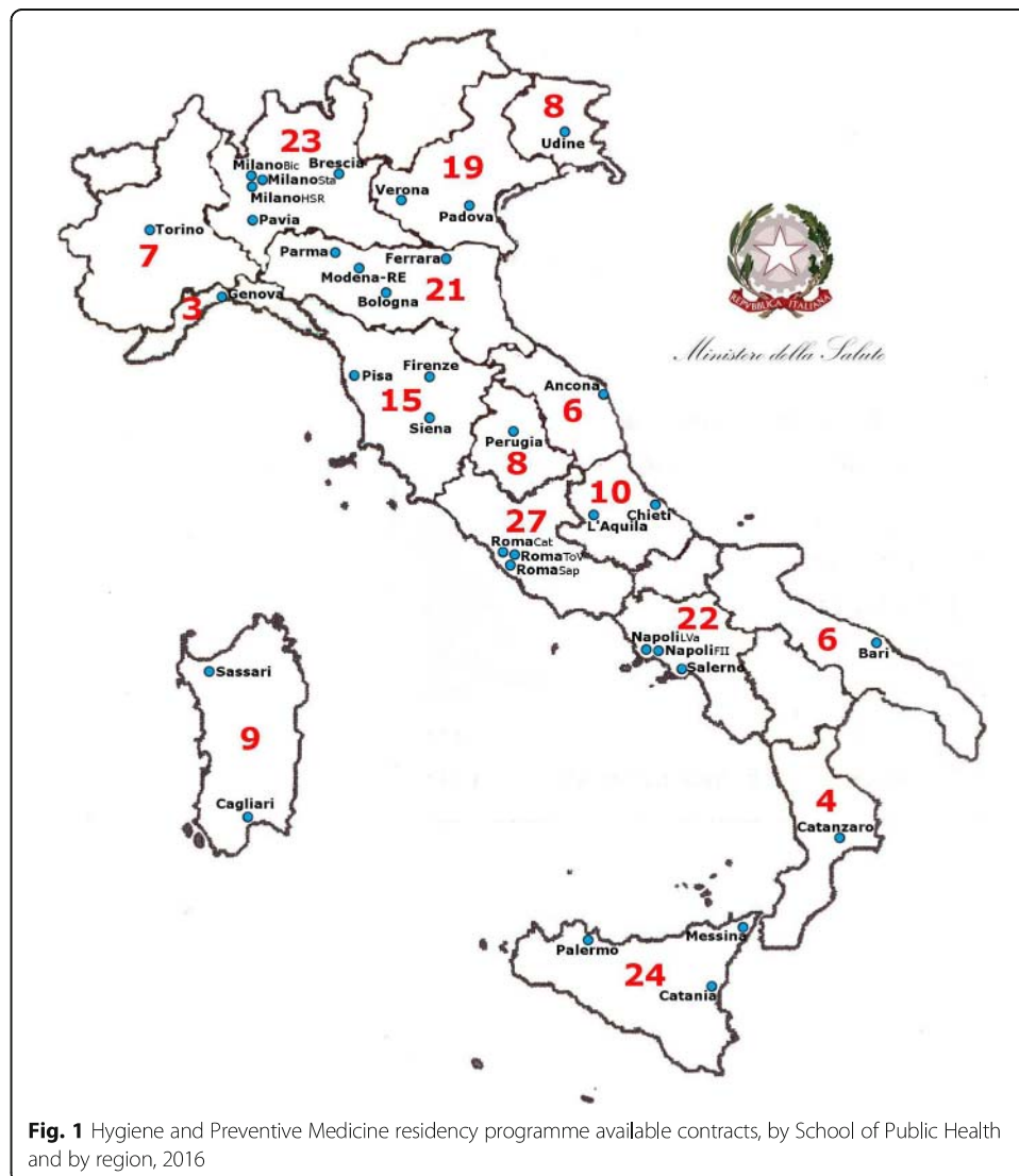
Fig. 1 Hygiene and Preventive Medicine residency programme available contracts, by School of Public Health and by region, 2016

accreditation criteria in terms of structural and organizational standards, professional development requirements, included core competencies, staff and faculty capacity needs.