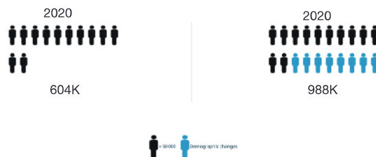
Estimated worldwide number of new cases of esophageal cancer from 2020 to 2040

Data source: GLOBOCAN 2020 http://gco.iarc.fir/today